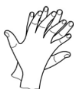
Step 2 Right palm over left dorsum and left palm over right dorsum (five times)