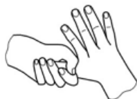
Step 5 Rotational rubbing of right thumb clasped in left palm and vice versa (five times)