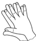
Step 3 Palm to palm with fingers interlaced (five times)