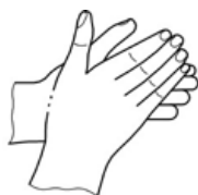
Step 1 Palm to palm